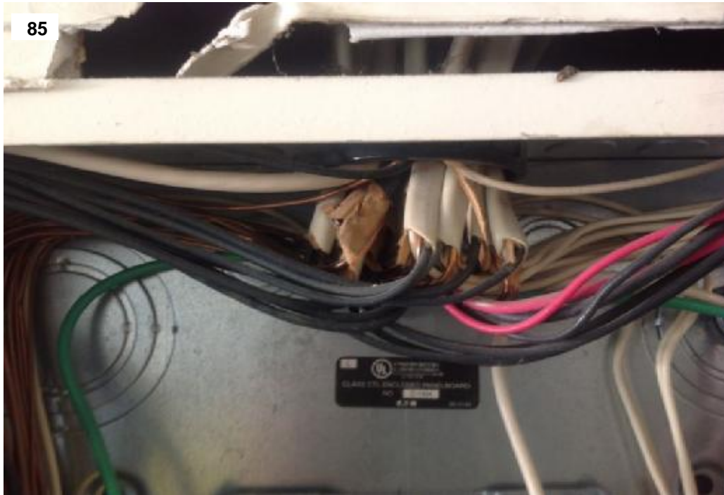
Conductor wires entering one knockout