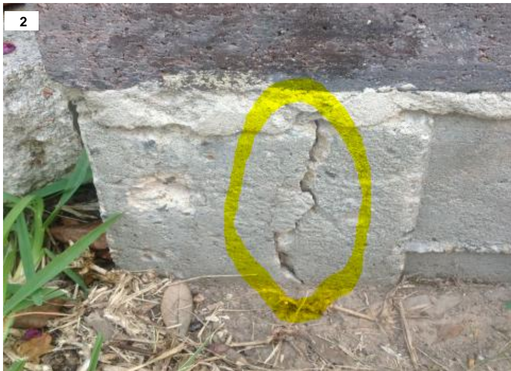
Corner pop Crack