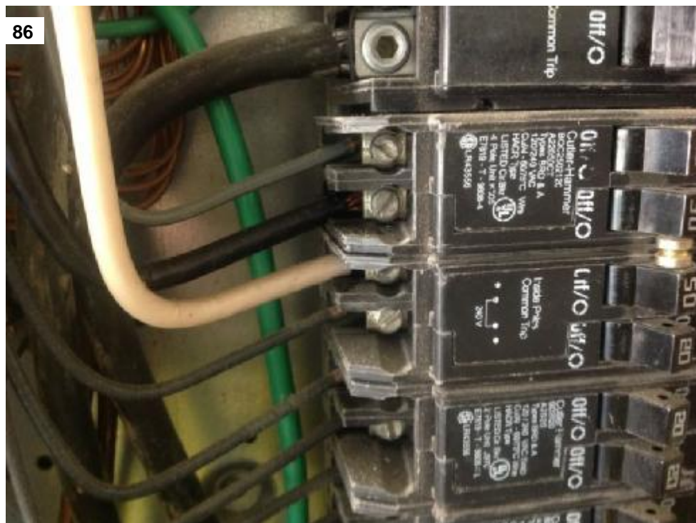
Neutral wire used as hot wire