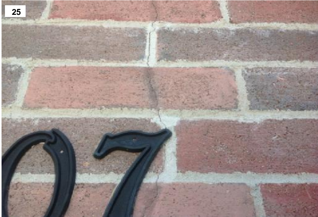
Crack in brick veneer located above garage