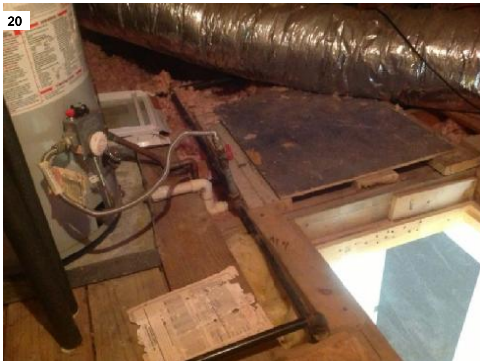
improper working platform in front of water heater