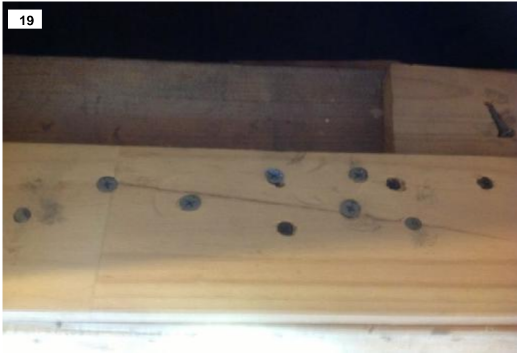
improper attachment of pull down stairs