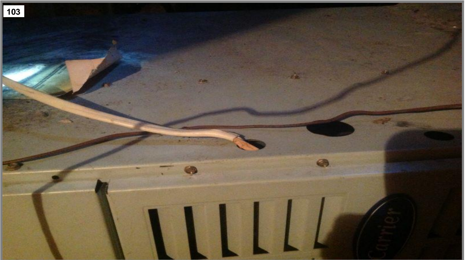
Unprotected wire going into furnace