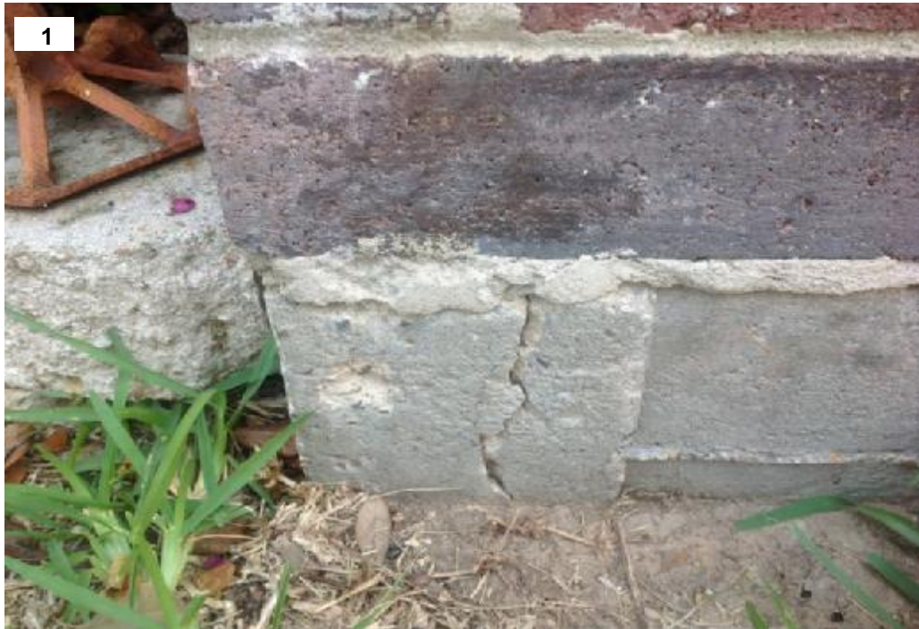
Corner pop Crack

Schedule Date : Thursday, October 31, 2013