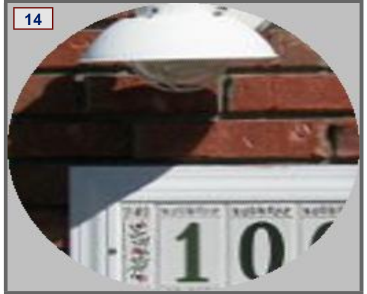
Front Light Bulb missing