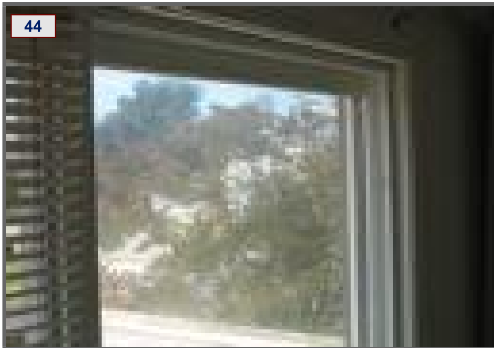
View of broken window glass at Master bedroom