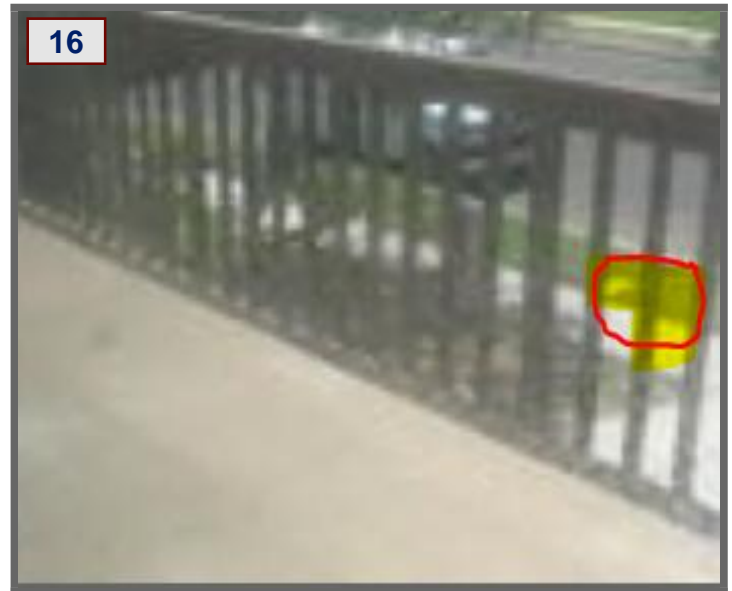
View of Exterior railing opening 7-8 inch