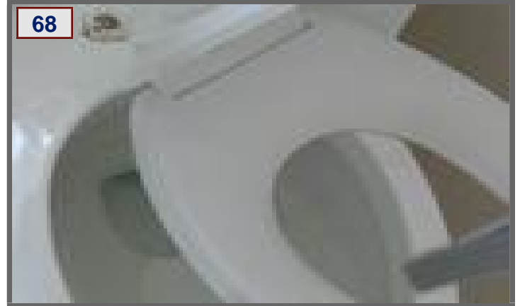
Master Bathroom Toilet: Seat Needs Adjustment / repair required to Operate properly (2) See Photo # 68