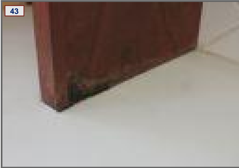
Hall Entry Door Water stain