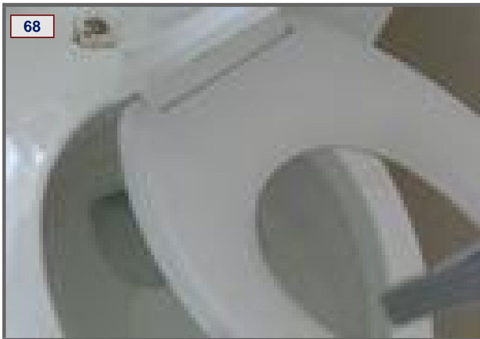
Master Bathroom Toilet: Seat Needs Adjustment / repair required to Operate properly (2) See Photo # 68