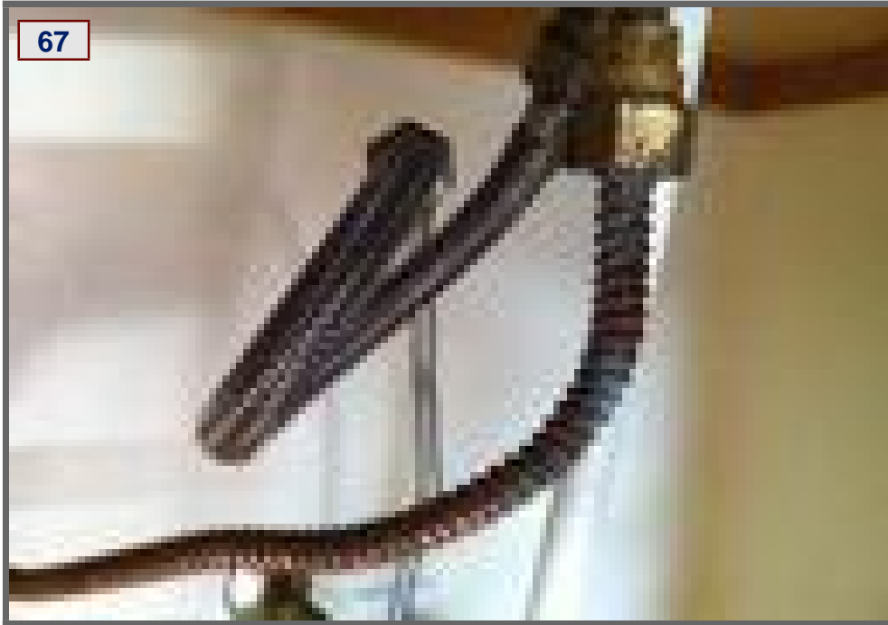
Master Bathroom Signs of past leaks/corrosion at drain lines under sinks. Noted Micro leek (2) See Photo # 67