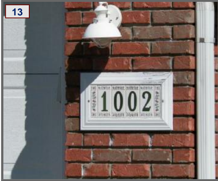
Front Light Bulb missing