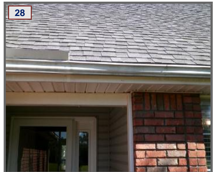
Shingles showing signs of weathering & age.