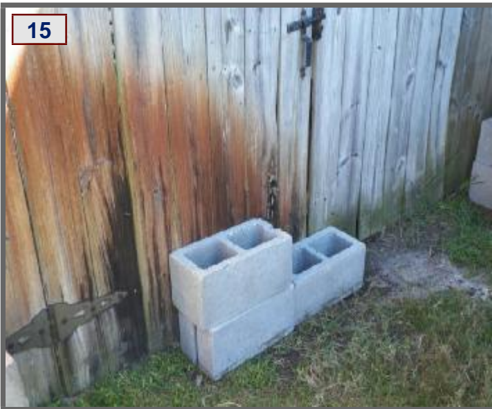
Water Damage At: Rear Gate, Gate loose will not open.