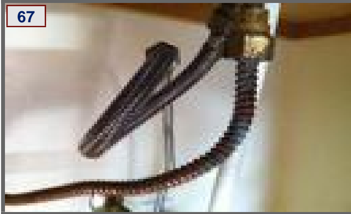
Master Bathroom Signs of past leaks/corrosion at drain lines under sinks. Noted Micro leek (2) See Photo # 67