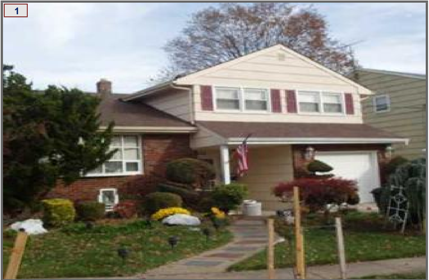
View from Street